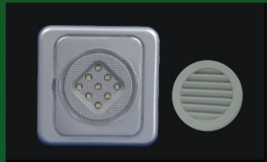
Weather Spot Light