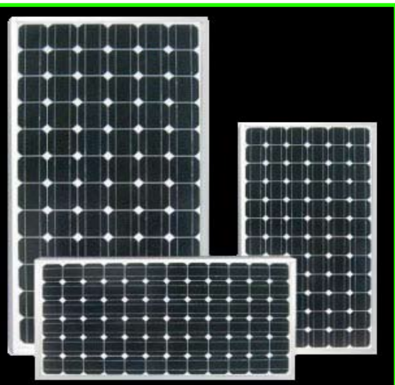
Solar Module 170 Watt ED67-SFM-170W