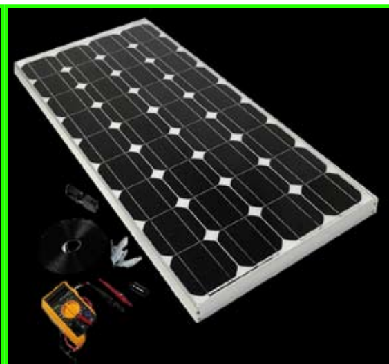
Solar Module 80 Watt ED67-SFM-80W