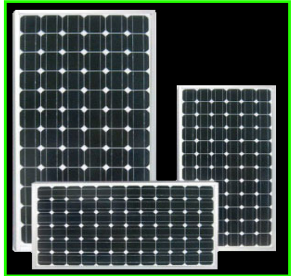
Solar Outdoor Sign Lighting Kit

Description The Solar Outdoor Sign Lighting Kit uses a high performance solar panel to generate energy during daylight hours which provides power to a sealed solar battery protected in a wall mounted water resistant battery box. From the battery box a cable leads to the 500mm LED strip (containing 30 high power, white LEDs), which can be mounted above, underneath or on the side of a sign using the supplied cowling. This light is bright enough to illuminate any sign up to 600mm wide x 1000mm deep and can operate for up to 8 hours per day, even in the British winter.