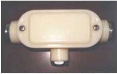
2 out let