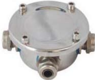
3 out let