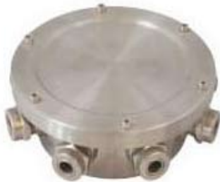
4 out let